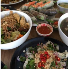
Medan Ciak Surry Hills