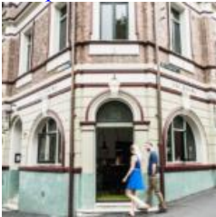
Xin Chao Campsie