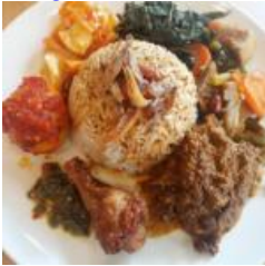
Osteria Coogee Coogee